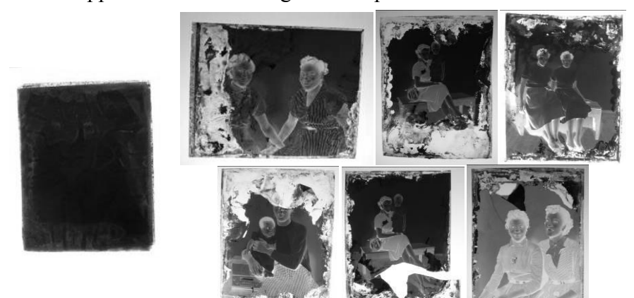
Fig. 11a. Block #6 - before treatment.

negatives were removed from the freezer they were either separated immediately by hand or placed into a 200 proof (absolute) ethanol bath to allow them to thaw before being separated. Placing frozen the negatives directly into ethanol reduces the gelatin emulsion's exposure to water and also lowers the freezing point, thus increasing the speed of thawing. This thawing technique proved successful for Mogens Koch and his colleagues in Germany during recovery of frozen photographic materials after the 2002 flood in Dresden (Kochs 2011). During this research project, the results of the ethanol thawing and the manual separation while frozen were very similar and