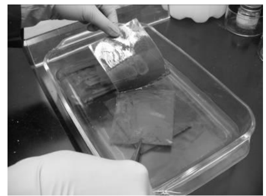
Fig. 10. Separating the negatives in the ethanol bath.

The blocked negatives were bathed in cold (50^{\circ} \text{ F}) de-ionized water for 10 minutes, and then placed into vapor-proof packaging, as previously described, and placed into the freezer. After seven days in the freezer, the negatives were removed, taken out of their packaging, and immediately placed into a glass tray filled with 200 proof (absolute) ethanol. This step was carried out in the fume hood. While the negatives were in the ethanol bath, separation was attempted using metal tongs and a Teflon spatula.