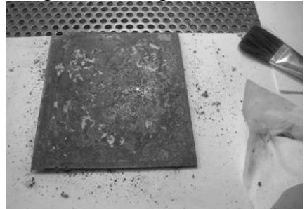
Fig. 3. During dry surface cleaning.