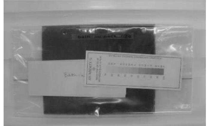
Fig. 9. Packaging in polyethylene bag.

The blocked negatives were placed into a polyethylene bag along with a humidity indicator card. The bagged negatives were then placed into gasketed cabinets in the SIA walk-in freezer. The RH in the lab at the time of packaging was 25%. After seven days in freezer, the interior of the the polyethylene bags were at 45% RH, according to the Humidity Indicator Temperature Correction Chart (www.sud-chemie.com). After seven days in the freezer, the packaged