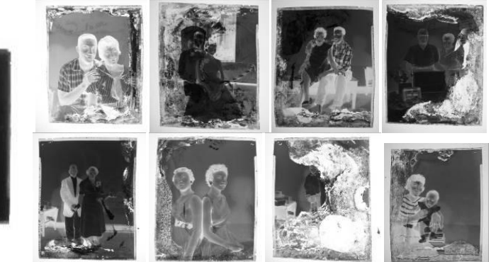
Fig 12b. Separated negatives from block #7 - after treatment – using technique # 20.