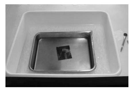
Fig. 6. Cold de-ionized water bath.

A metal tray was filled with de-ionized water and placed into a larger plastic tray filled with ice water. The use of a metal tray was crucial in order to allow for thermal conductivity. Once the de-ionized bath water reached a temperature of 50° F, the blocked negatives were placed into the bath. Manual separation of the negatives was tested after 30 seconds, one minute, five minutes, and 10 minutes of immersion.