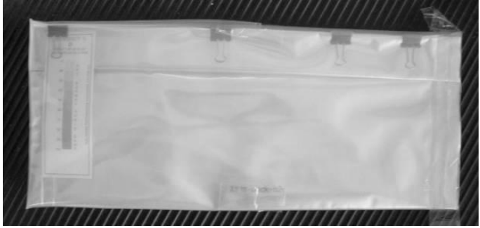
Fig. 8. Vapor-proof packaging.

from the freezer after 7 days and the RH indicator still read 25% RH. The packaged negatives were taken into the lab and the packaging was opened and manual separation of the negatives was attempted immediately. As soon as the negatives were separated, they were placed into a cold (50° F) de-ionized water bath. The negatives were rinsed for approximately two minutes.