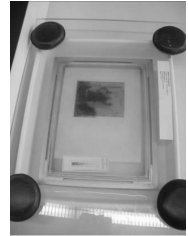
Fig. 7. Humidification chamber.

A humidification chamber was set-up using a plastic tray with a metal screen inserted to elevate the object above a shallow layer of room temperature (68° F) de-ionized water. The blocked negatives were placed onto the screen over a sheet of non-woven polyester. A humidity indicator card was also placed in the chamber and the chamber was sealed by laying a sheet of Plexiglas and weights over the top of the tray. The chamber reached an RH of 80%. Manual separation of the negatives was tested after three hours in the chamber and again after a total of 4.5 hours.